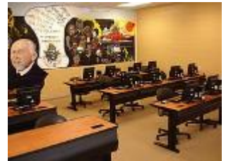
New Library Computer Lab

ProQuest - Magazines, Newspapers, & Journals